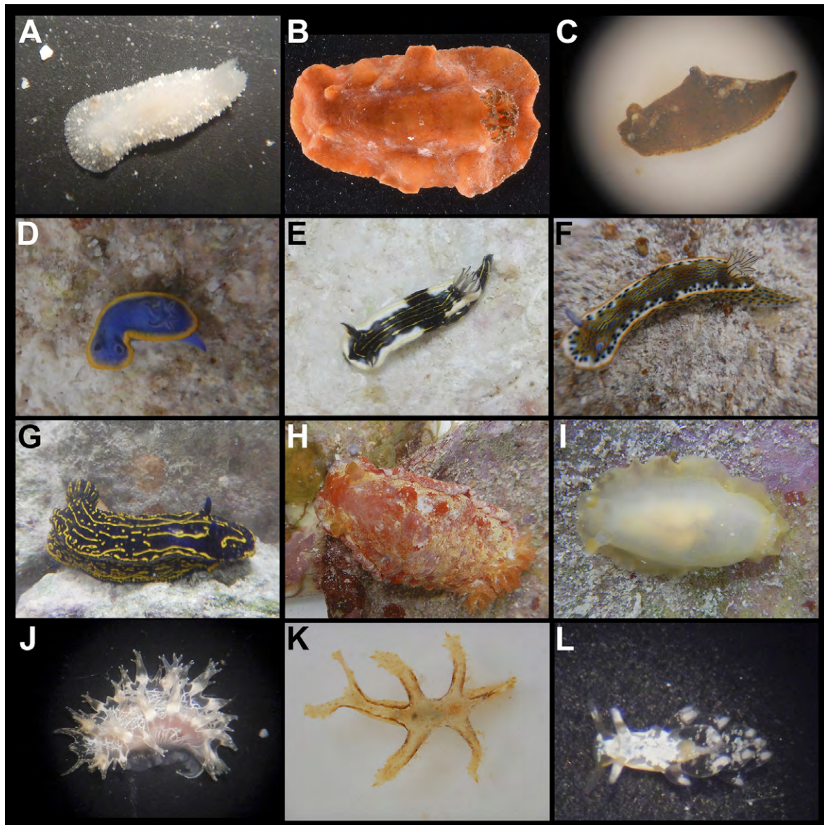
Figure 2. Species from Cayo Arcas and Cayo Arenas. A. Sclerodoris worki (Ev. Marcus and Er. Marcus, 1967), B. Platydoris angustipes (Mörch, 1863), C. Polycera odhneri Er. Marcus, 1955, D. Felimare nyalya (Ev. Marcus and Er. Marcus, 1967), E. Felimare ruthae (Ev. Marcus and Hughes, 1974), F. Felimare bayeri Ev. Marcus and Er. Marcus, 1967, G. Felimare picta (Schultz in Philippi, 1836), H. Hexabranhus morsomus Ev. Marcus and Er. Marcus, 1962, I. Dendrodoris krebsii (Mörch, 1863), J. Tritonia bayeri Ev. Marcus and Er. Marcus, 1967, K. Scyllaea pelagica Linnaeus, 1758, L. Cuthona sp.