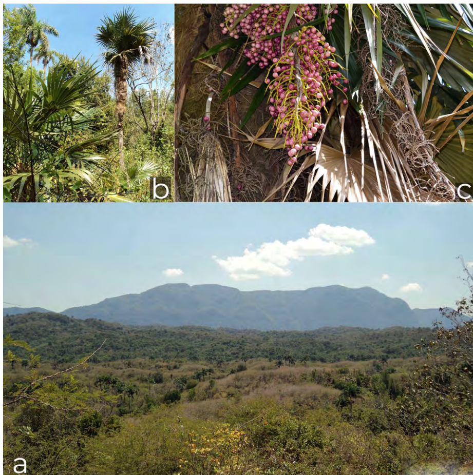
Figure 1. Coccothrinax crinita in its natural habitat. a) Region of Las Pozas, Artemisa Province; b) adult specimen; c) mature fruits.

The study was conducted near Las Pozas (Fig. 1), a rural community located at 22°50' N, 83°17' W, Artemisa province, western Cuba, 17 km from the municipality of Bahía Honda. This locality is in the Pan de Guajaibón foothills, the highest elevation of Sierra del Rosario. The site presents an altitudinal range of between 36-156 m, decreasing from south to north. The carbonated soil is derived from igneous serpentinite rocks (brown tropical soil) and, in some cases, with serpentinite outcrops. Soil type is lithic Calcic Cambisol according to FAO-Unesco (1975). There are several hills at the base of Pan de Guajaibón to the north (Pinares, 2004). The habitat of C. crinita is a thorny xerophyte scrub on serpentine with secondary shrub vegetation in the most humid portion nearest to the gallery forest (Verdecia & Barrios, 2015). Annual mean temperature and precipitation values are 24.9 °C and 1,307 mm, respectively, which is characteristic of the Cajalbana district according to Borhidi (1996).